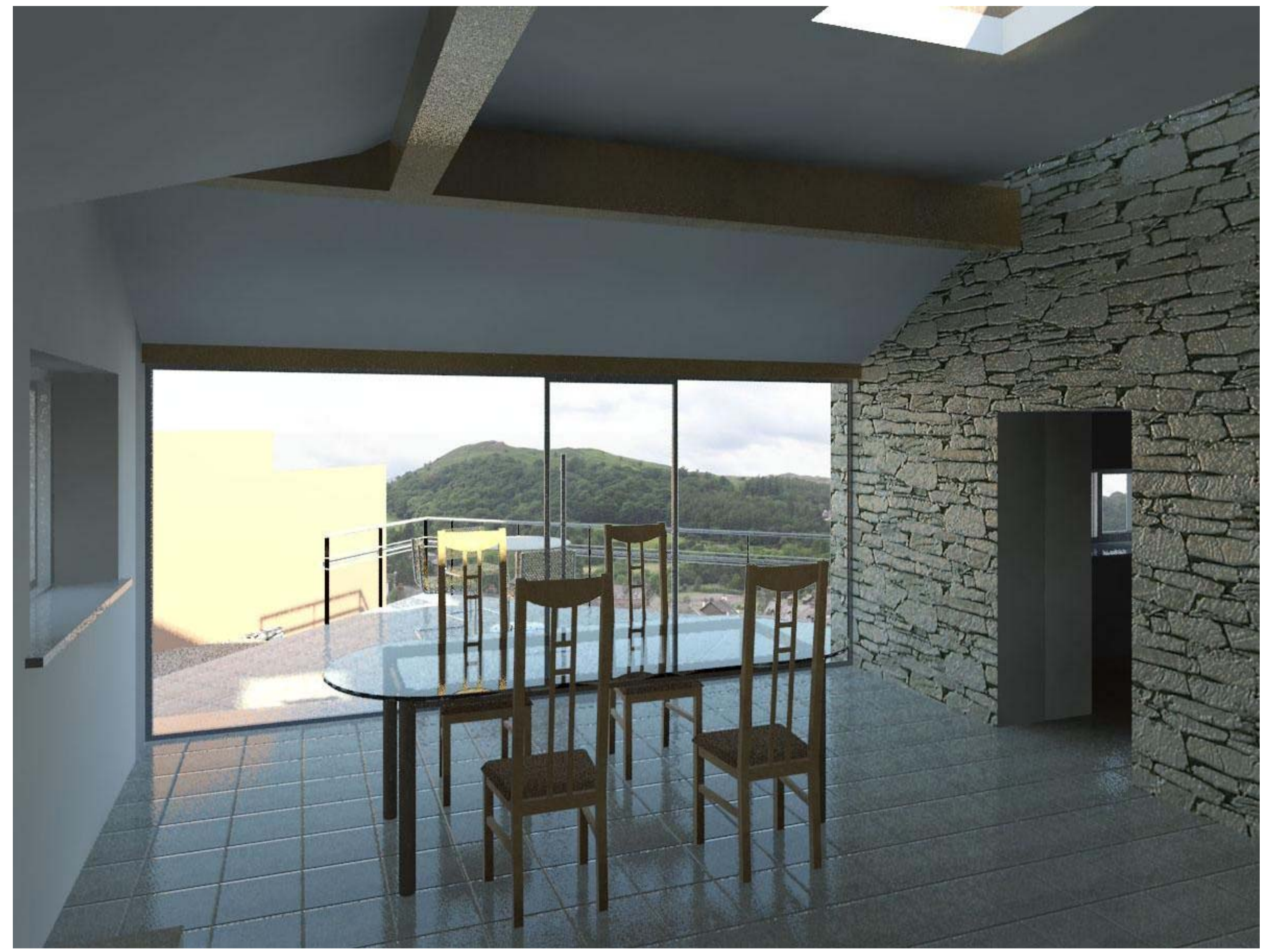
Rendered Interior View of model to give an impression of view