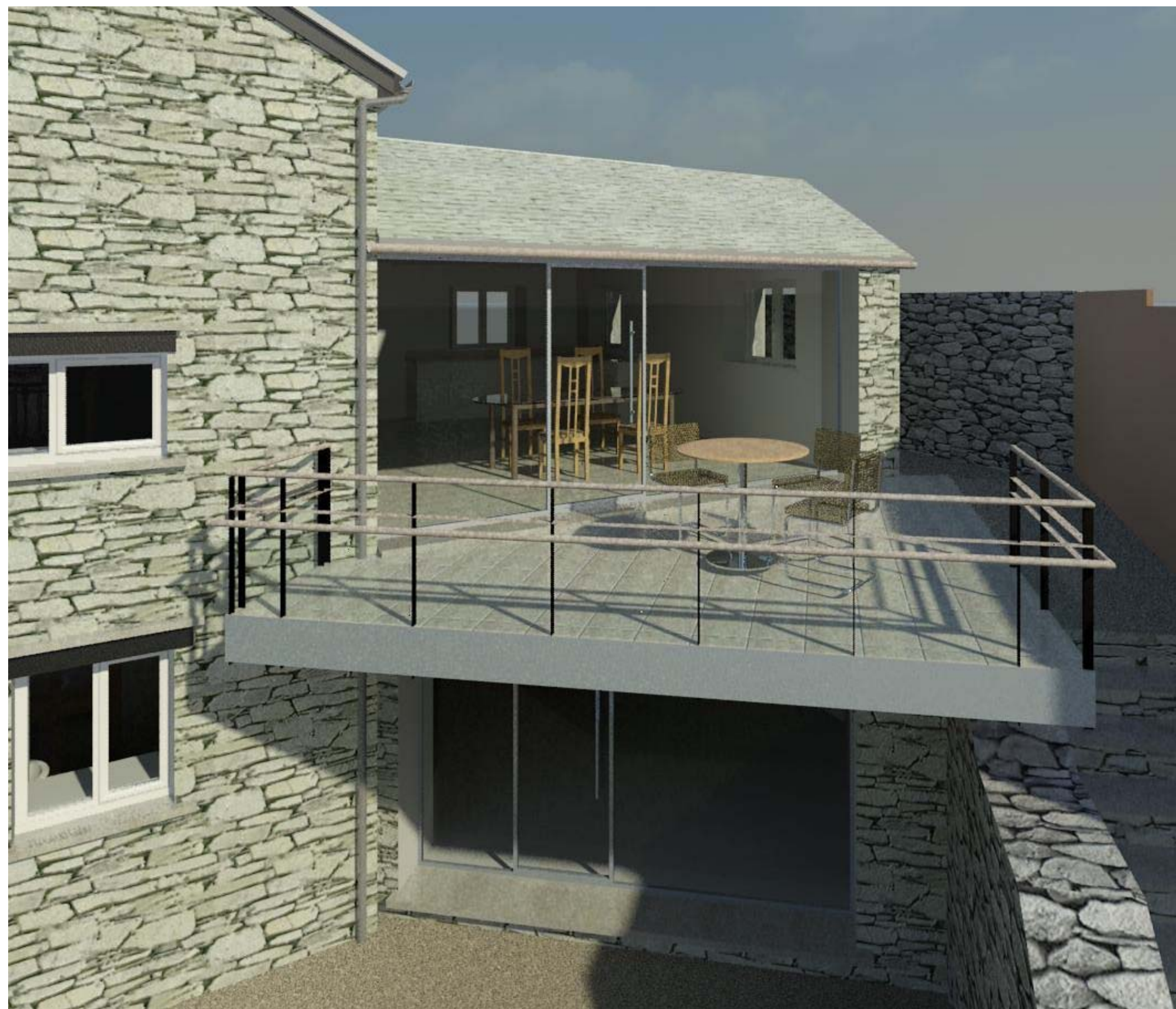
Rendered Aerial View of model